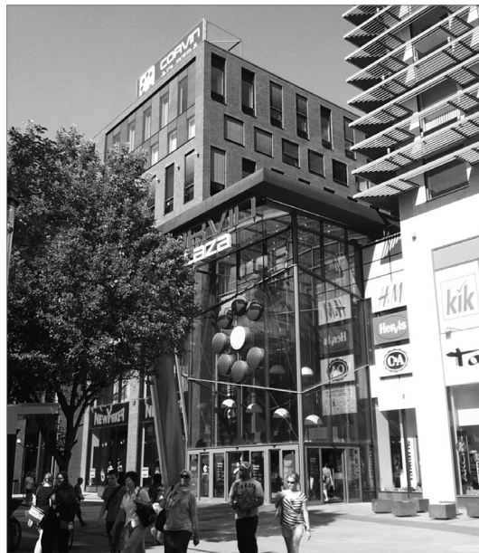
Fig. 6: Residential buildings of the Corvin Promenade project